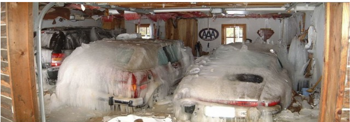
House in the country .... $1 Million.

NOTE: NO CREDIT IS AVAILABLE ON WATER BILLS FOR WATER WASTED TO PREVENT FREEZING UNLESS THE CITY THAWED THE LINE AND DETERMINED RESPONSIBILITY FOR THE PROBLEM. The City then has the option of issuing a written authorization to waste water if no other corrective action is feasible at the time.