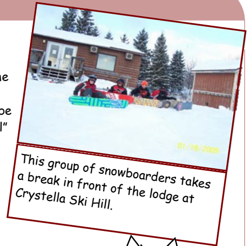
This group of snowboarders takes a break in front of the lodge at Crystella Ski Hill.

SO PULL ON THOSE SNOW PANTS, GRAB YOUR SNOW TOYS, AND WE'LL SEE YOU AT THE HILL!