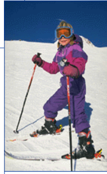
Enjoy skiing at the Crystella Ski Hill