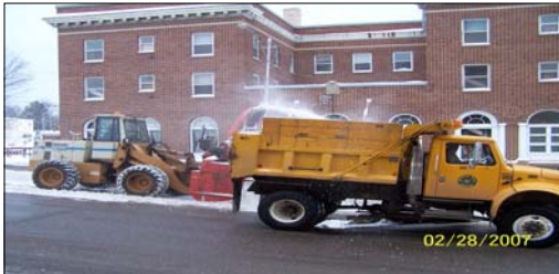
The City crews clean up the snow on Superior Avenue. Please use caution when driving near any snow removal equipment.