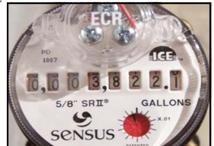
The water meters are easy to read.

comply may result in the termination of water service to the home until rectified. Need help financing a new water line? See the front page story about low interest loans!