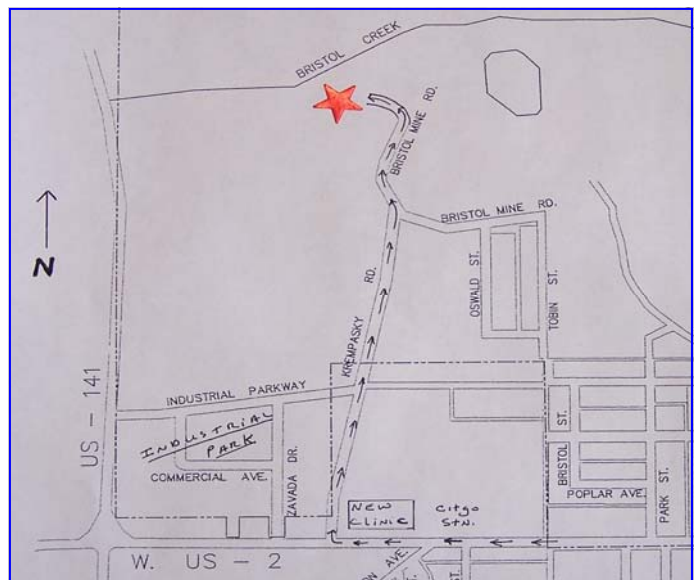
The City's Spring Clean-Up site is located at the Bristol Mine. Turn right onto Krempasky Road (along the West side of the new clinic) and follow the road North to the drop off site.

As always, the City will pick up yard rakings at the curbs, branches must be no longer than 4 feet. To take advantage of the curbside pickup your rakings must be ready for pickup by Monday May 19th. To allow City equipment access to your yard rakings do not park a vehicle anywhere near the piles.