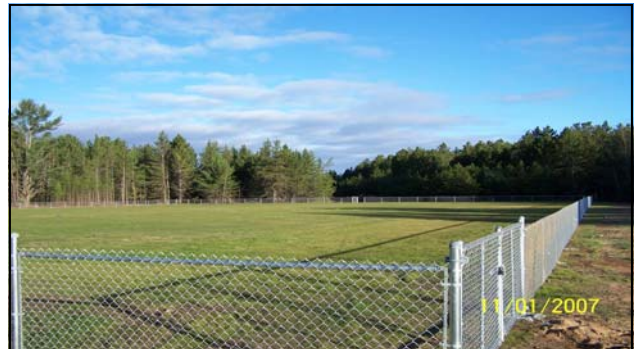
Newly constructed soccer/youth football field at Runkle Lake Park. This field is located just North of the tennis courts.

The total cost of the field will be somewhere in the area of $33,000 to $38,000 with