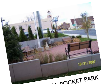
CITY HALL POCKET PARK

As part of the Streetscape project in downtown Crystal Falls three pocket parks were developed.