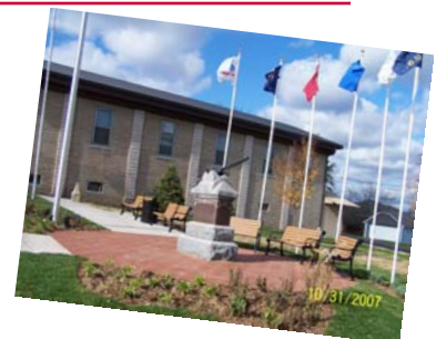
VFW POCKET PARK