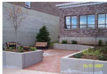
LIBRARY POCKET PARK