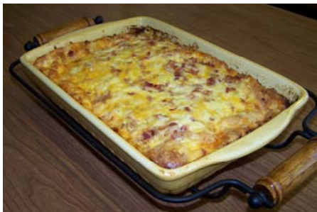
The Breakfast Souffle is perfect for those early morning family gatherings. It's easy to make and very yummy!

Cook sausage over medium heat until done. Drain well on paper towels, set aside. Combine sausage and remaining ingredients and mix well. Pour into well greased 13 x 9 x 2 inch baking dish. Refrigerate overnight (well covered). Bake at 350° for one hour. Serves 8 to 10. (Bacon can also be used)