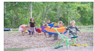
Children enjoy the new playground equipment at Lincoln Park during the grand opening

Coca-cola) to the visitors at the park. The committee began the project in the summer of 2008 with the initial idea coming from the former VJ Day Committee with seed money ($1000) donated